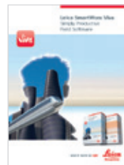
Leica SmartWorx Viva Product brochure