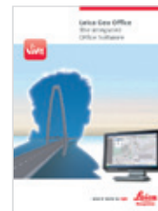
Leica Viva LGO Product brochure