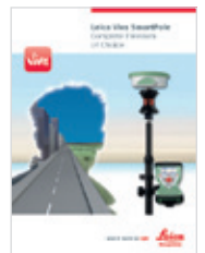
Leica Viva SmartPole Product brochure