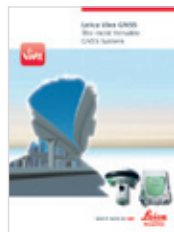
Leica Viva GNSS Product brochure