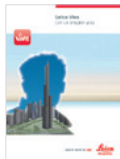
Leica Viva Overview brochure

Illustrations, descriptions and technical data are not binding. All rights reserved. Printed in Switzerland – Copyright Leica Geosystems AG, Heerbrugg, Switzerland, 2012. 774100en – 01.14 – galledia